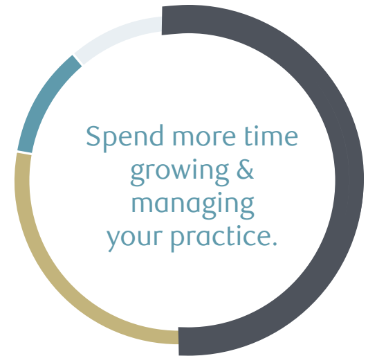
For illustrative purposes only.

With our help and support, you can spend less time on reviewing investments, rebalancing portfolios, and managing performance. You have more time and resources supporting you so you can focus on your business.